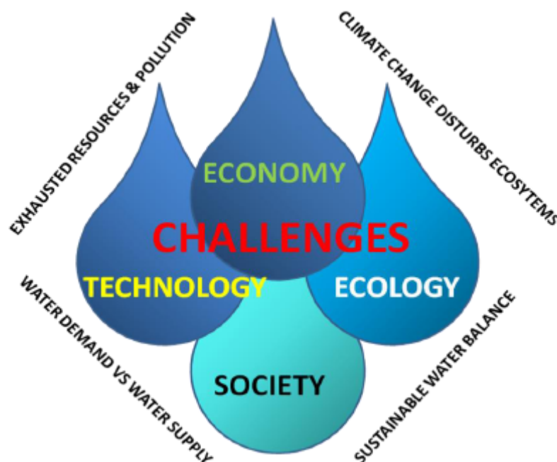
Figure 1. Drivers and multidisciplinary challenges to be addressed.

Addressing this challenge will require a multi-disciplinary approach, since economic, ecological, technological and societal challenges are to be addressed (Figure 1). The JPI will contribute to the challenge through coordination of National and Regional RDI policies and programmes.